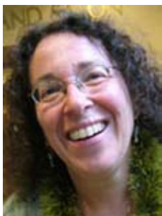
Laura S. Brown

Why and how does psychological trauma harm people? The traditional assumption in trauma research has been that extreme fear is at the core of post traumatic responses to events like war and natural disasters. This assumption is at the heart of the PTSD Criterion A definition in the DSM IV-R : “witnessed or experienced an event threatening to safety or life.” Is terror the only cause of traumatic distress and harm? Some patterns of events (such as sexual abuse by a parent, acquaintance rape, or government mistreatment of citizens) generate strong symptoms of trauma even absent intense fear, perhaps